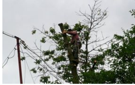
Our ladder collection, one of our cats, one of the 4 cherry trees needs some trimming....

So the weeks rolled by some of them rainy, some of them sunny, and Irmi and I managed to get most of the garden dug up and ready for new plants, and we planted some new plants, for example red beets, and radishes, and sweet peas, also some pumpkin and zucchini seeds went into the ground. We made 3 new compost sites, and filled them generously. The last one having no borders, just sprawling out in a long thick line of dirt and roots and grass, and compost-able material.