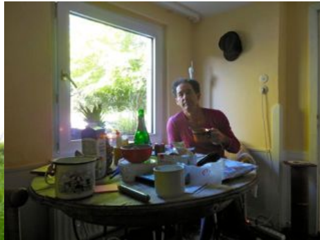
High grass, coffee and red wine