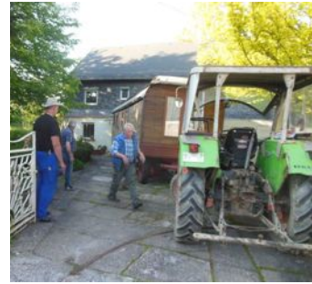
All our new neighbors were helping to get the wagon into our place

Anyhoot somehow we are sort of not in our normal element of gypsy-izm, things are different now, that's not bad, in fact we are closer to just being normal citizens of our capitalistic world, or lucky westerners as I like to put it. At the same time we are in our element, as we both enjoy the great outdoors.