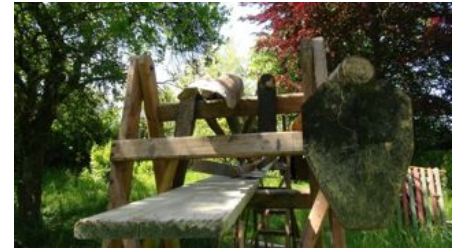
The mayor gave us his trailer after we burned a lot of wet wood, and we got our 1 st complaints.

We are observing many things along this way, and I am trying to be more compliant in my social world, as I have seen how it was for the Indians when they did not conform to what society was doing. The small rebel side of me say's no! if you don't feel good about it, don't do it. So sometimes I do things, and sometimes I don't do things.