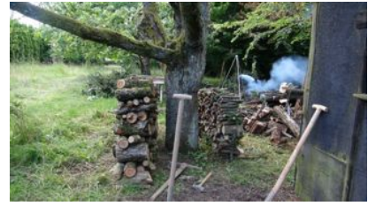
Planting, resting, making firewood for the winter.... e.t.c.....